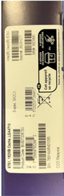
Current (Not Tamper Evident)