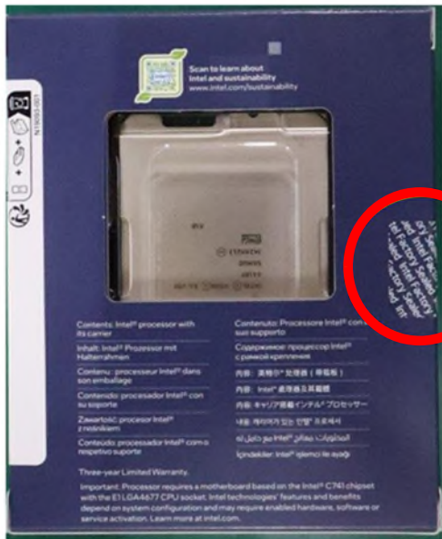
Current (Not Tamper Evident)