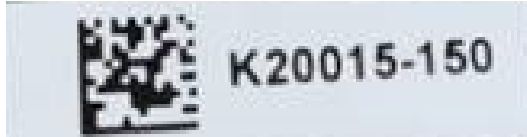
Current Mother Board Serial Number Label (sample)