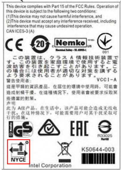
Common Regulatory Label