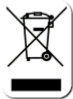
Picture 2 WEEE logo

Most of Intel's semiconductor components are generally not considered within the scope of the WEEE Directive; however, the scope of the Directive can vary between Member States. In order to address potential scope and registration issues in a minority of Member States, certain components may be labeled with the wheelie bin symbol. Intel considers its chassis-level server products to be within the scope of the WEEE Directive, although the final assembly and/or configuration of these systems are commonly completed by commercial customers.