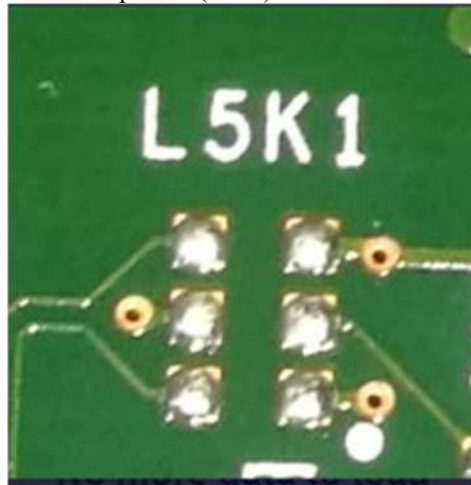
Balun component (After)