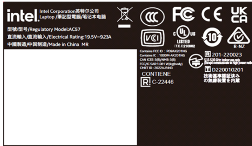
180W system rating label (before)