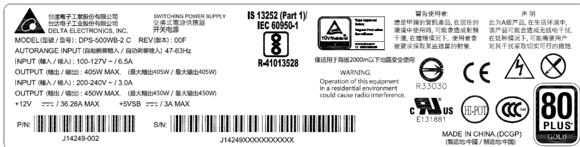
Figure-1 Old label