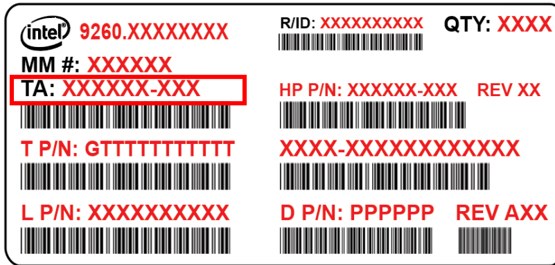
Table – TA Dash Up