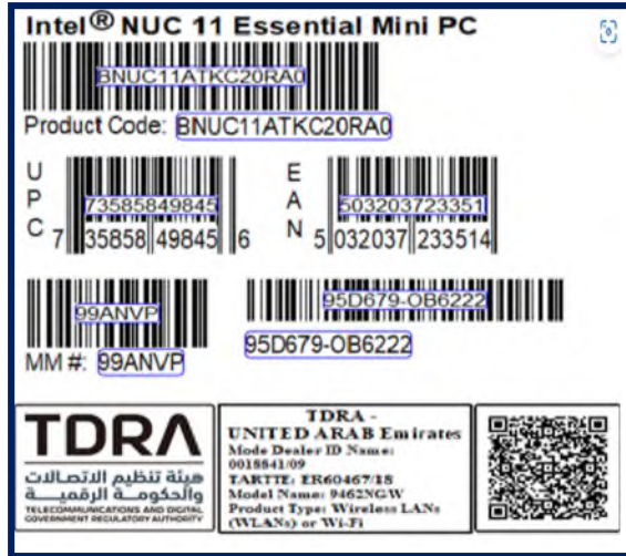
Current L10 Box label (sample)