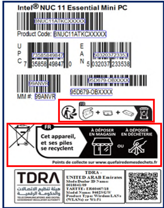
New L10 Box label (sample)