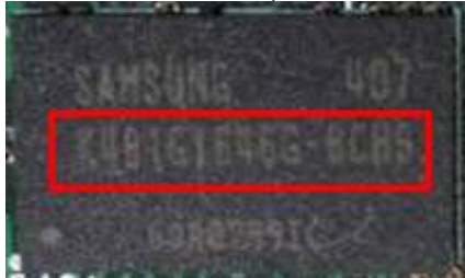
New DDR3 (J37656-001)