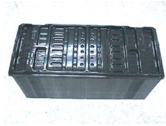
Figure : Tray stack with black Thermoform cover