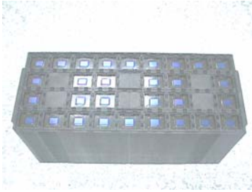
Figure : Tray stack with empty Tray cap used as cover tray