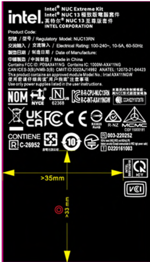
New Rating Label (sample)