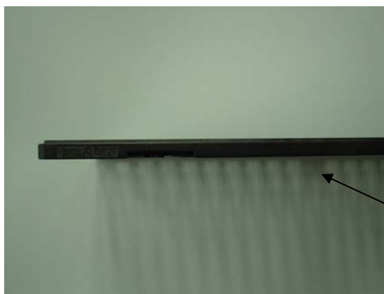
Location of Yellow stripe

Location of yellow strip on the long side of the 14mm 2 Tray: