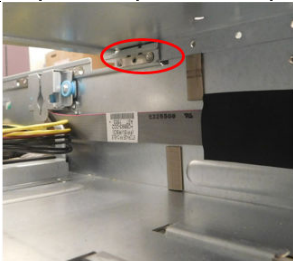
Image 2. After change - Chassis without EMI clips