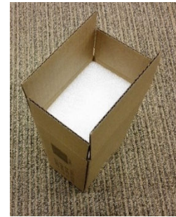
New Packaging Method