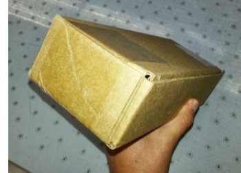
Previous Packaging Method