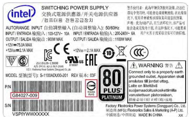
Image 2. Power supply label after change