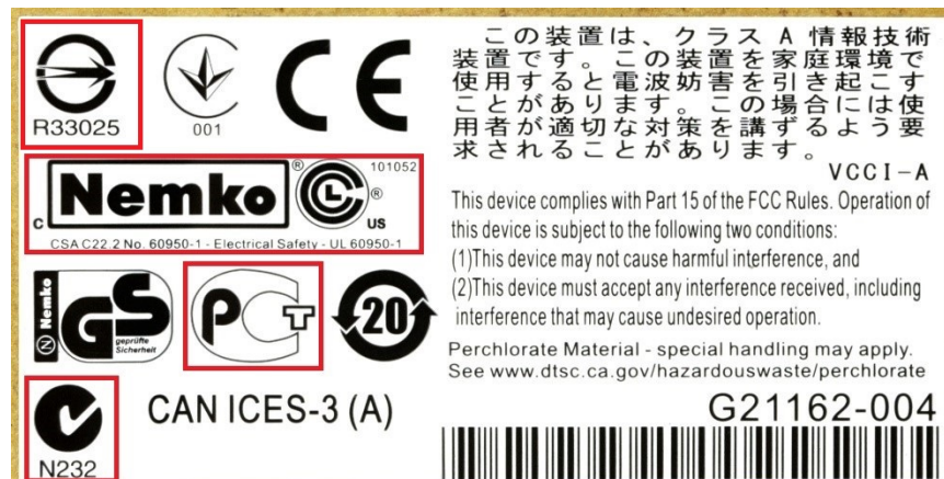
Figure-1: Pre change label