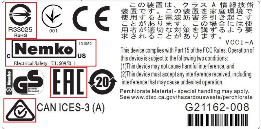
Figure-2: Post change label