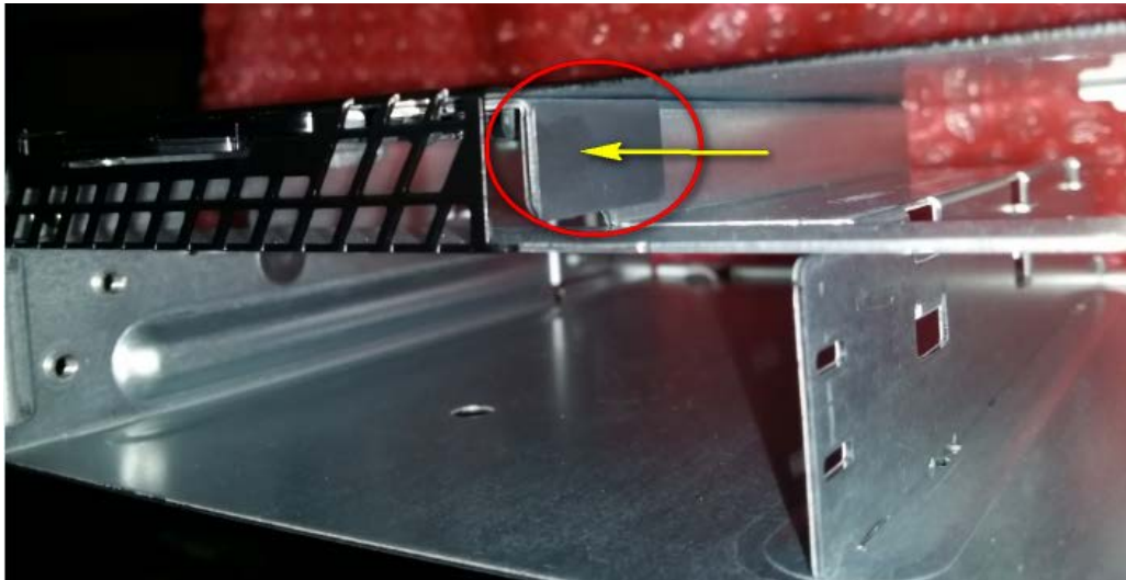
Example of the mylar bumper on the side of the DVDROM bay