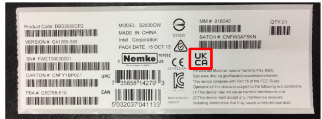
Figure 2. Package Label - After